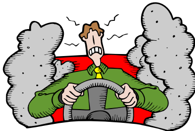
Nux Vomica in Traffic

Call me Type "A". Alpha Dog. Top Dog. Workaholic. Over-Achiever. Rude. Prick. Impatient. Inconsiderate. Ambitious. Driven. Angry. Jack Ass. Picky. Compulsive. Cold. Heartless. Jealous. Petty. Sex-monger. Alcoholic. Addict. Call me whatever you want and then how 'bout I kick your ass for it?